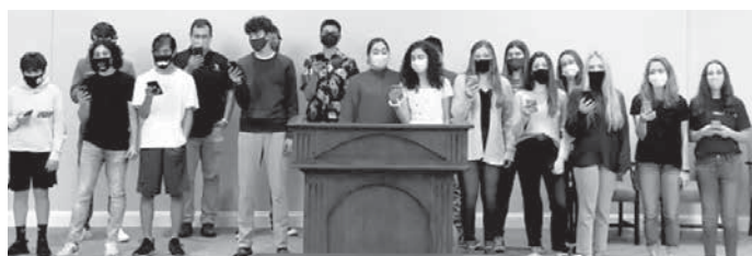
Farmington Hills young people singing "It's My Desire"