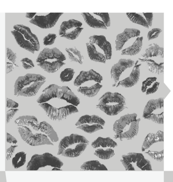
July 6 International Kissing Day (Kiss a brother or sister of your choice,... let's make it a holy kiss.) Romans 16:16