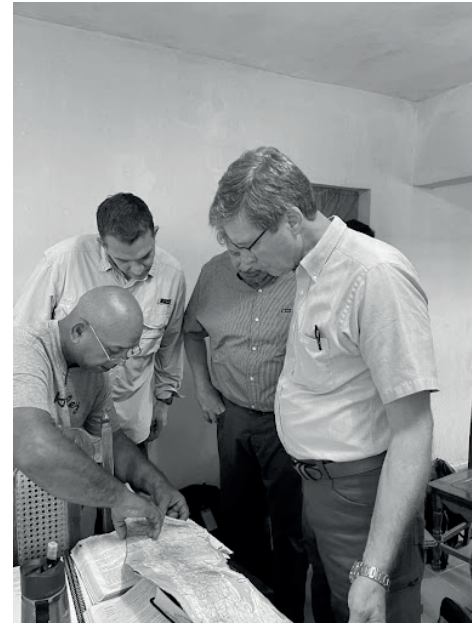
A Cuban map is presented to our Church President Las Tunas, Cuba