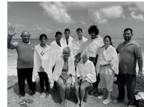
Additional converts commit to the Lord on February 19, 2022, including five young people. Bahia de Manatí, Cuba